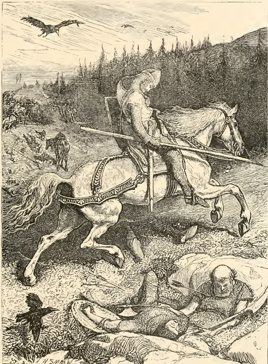
THE VISION OF DON RODERICK. -- Page 272.